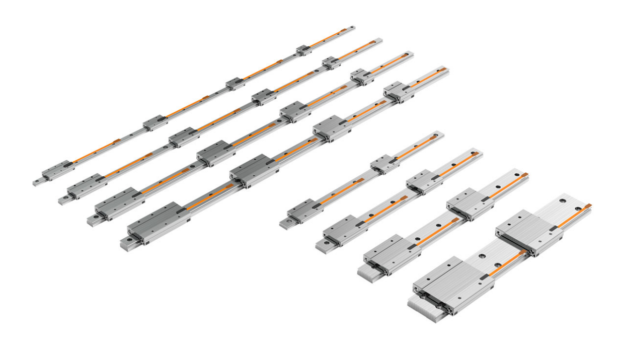
B02: The miniature guideways with integrated measuring system offers maximum acceleration of 300 \text{ m/s}^2 at a maximum speed of 5 m/s.