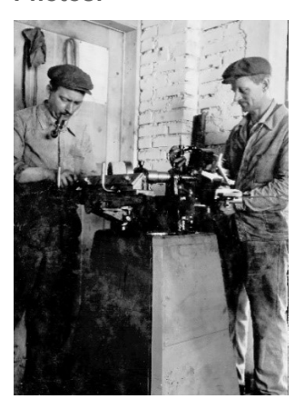
P01: 100th anniversary of the SCHNEEBERGER Group. A success story from sharpeners to linear bearings.